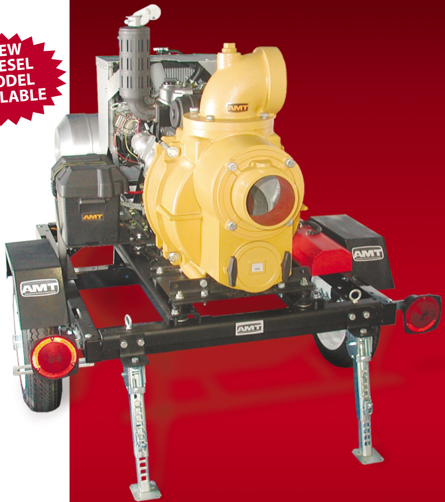
6" Diesel Driven Trash Pump

Requires 12 Volt Battery; BCI Group 24, Min. of 500 CCA (Cold Crank Amps) Battery Box Cables setup for automotive post type connection.